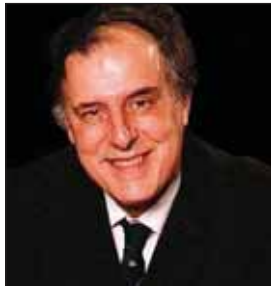
With wine and canapés £22.50