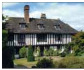
With wine and canapés £15