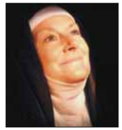
With wine and canapés £22.50