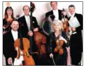
With traditional English afternoon tea £25