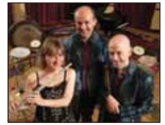
With wine and canapés £22.50

SATURDAY 10 July at 7.30pm CLASSIC RHYTHM This brilliant trio for flute, piano and percussion has been taking the country's concert circuit by storm in recent years. The quality of their musicianship and the unique blend of arresting instrumentation and entrancing arrangements have received rapturous applause the length and breadth of the British Isles and beyond. The programme includes renderings of favourite classical compositions: Handel's Arrival of the Queen of Sheba , a movement from Haydn's 'Clock' Symphony , Tchaikovsky's Nutcracker Suite , Rimsky-Korsakov's Flight of the Bumble Bee and other virtuoso pieces. The whole performance is presented with wit and charm. The Musical Opinion review described the trio's Purcell Room recital as 'remarkable...played with instinctive precision.'